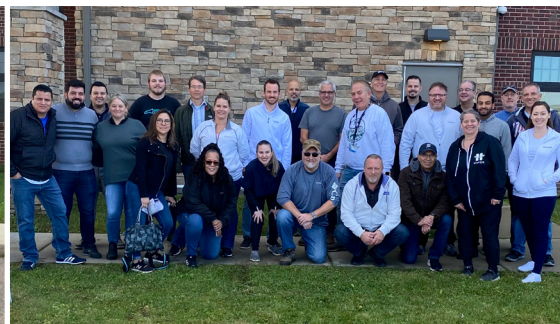
Forvia Interiors-North America Volunteers