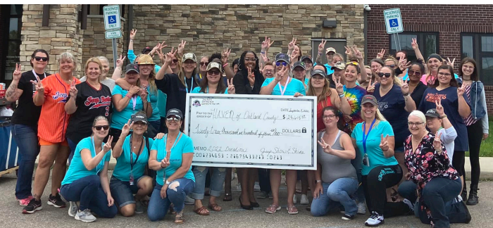
Jeep Show & Shine - A Charity Fundraiser for HAVEN