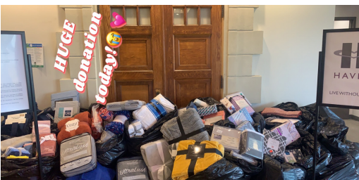
Many donations for Gift Give Away