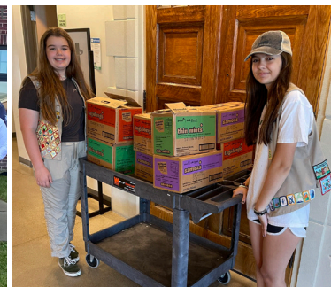
Girl Scout Troop 75949 cookie donation